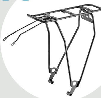
CL - 642 Alloy Rear Carrier Normal bike Disk brake carrier