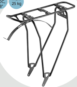
CL - 640 Alloy Rear Carrier Normal bike, Seatstay bridge/ fender mount carrier