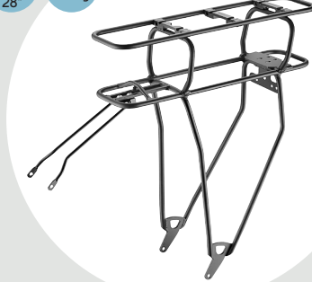
CL - 639 Alloy Electric Rear Carrier Bosch rear battery pack carrier