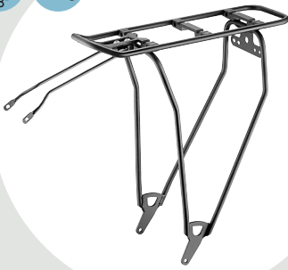
CL - 638 Alloy Rear Carrier Normal bike Seatstay mount carrier