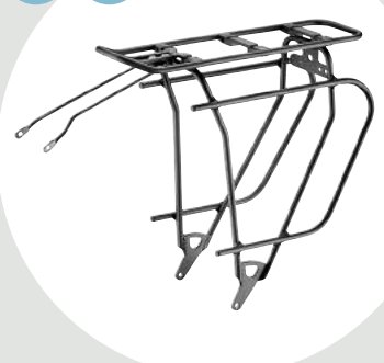
CL - 643 Alloy Rear Carrier Normal bike, Seatstay mount with pannier carrier