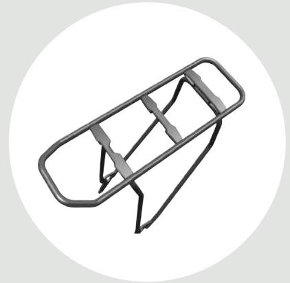
Example of MIK profiles for trekking bicycles