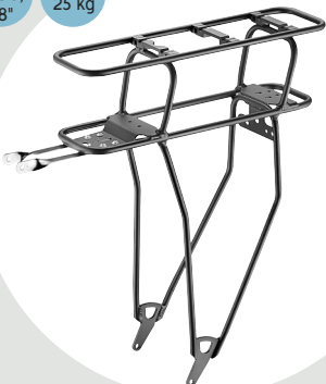
CL - 641 Alloy Electric Rear Carrier Shimano Steps rear battery pack carrier